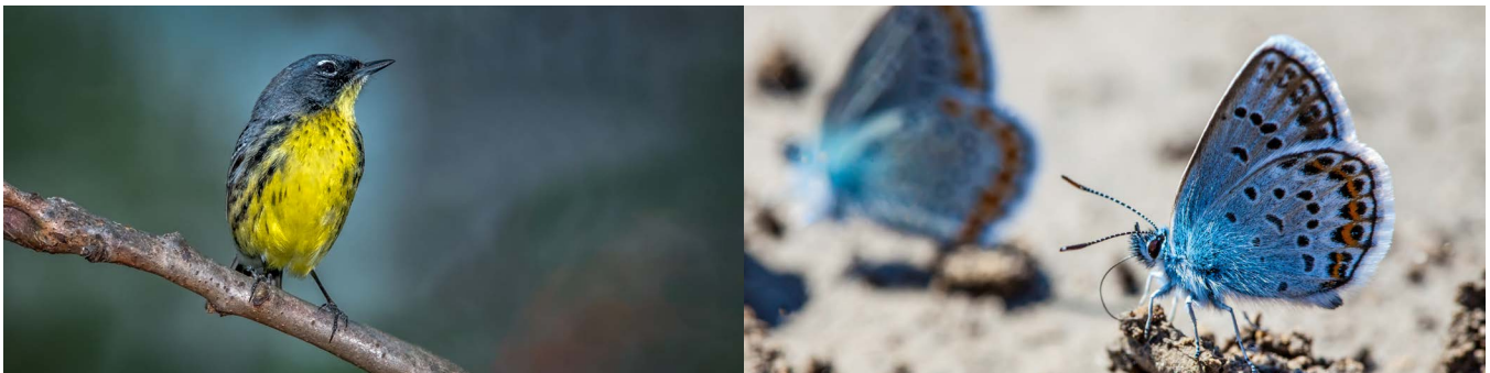
> Kirtland's Warbler and Karner blue butterfly

The lands sold had previously been identified by the state of Wisconsin as providing unique habitat for important native plant communities and wildlife species.