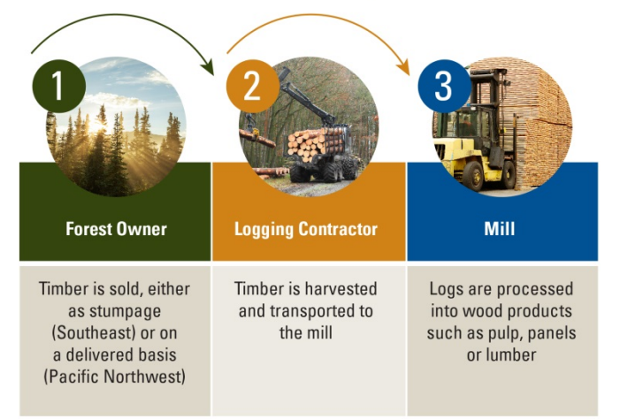
Figure 2. Typical value chain for wood products before they become consumer products and enter end-use markets. Note that depending upon the local market, the logging contractor may be (a) hired by the forest owner to deliver wood to the mill; (b) hired by the mill to harvest wood from the forest owner; or (c) an independent wood broker who is buying timber from the forest owner and selling it to the mill.

Based on this analysis, a $10 per barrel drop in the price of oil translated into approximately a $0.60 per ton drop in logging costs in the South